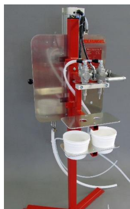
Outlets for resin and catalyst