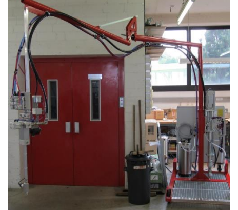
iJect touch UP 150 with Options

The process control ensures repeatable processes and part quality. The automatic flushing system guarants an efficient and resource-saving cleaning.